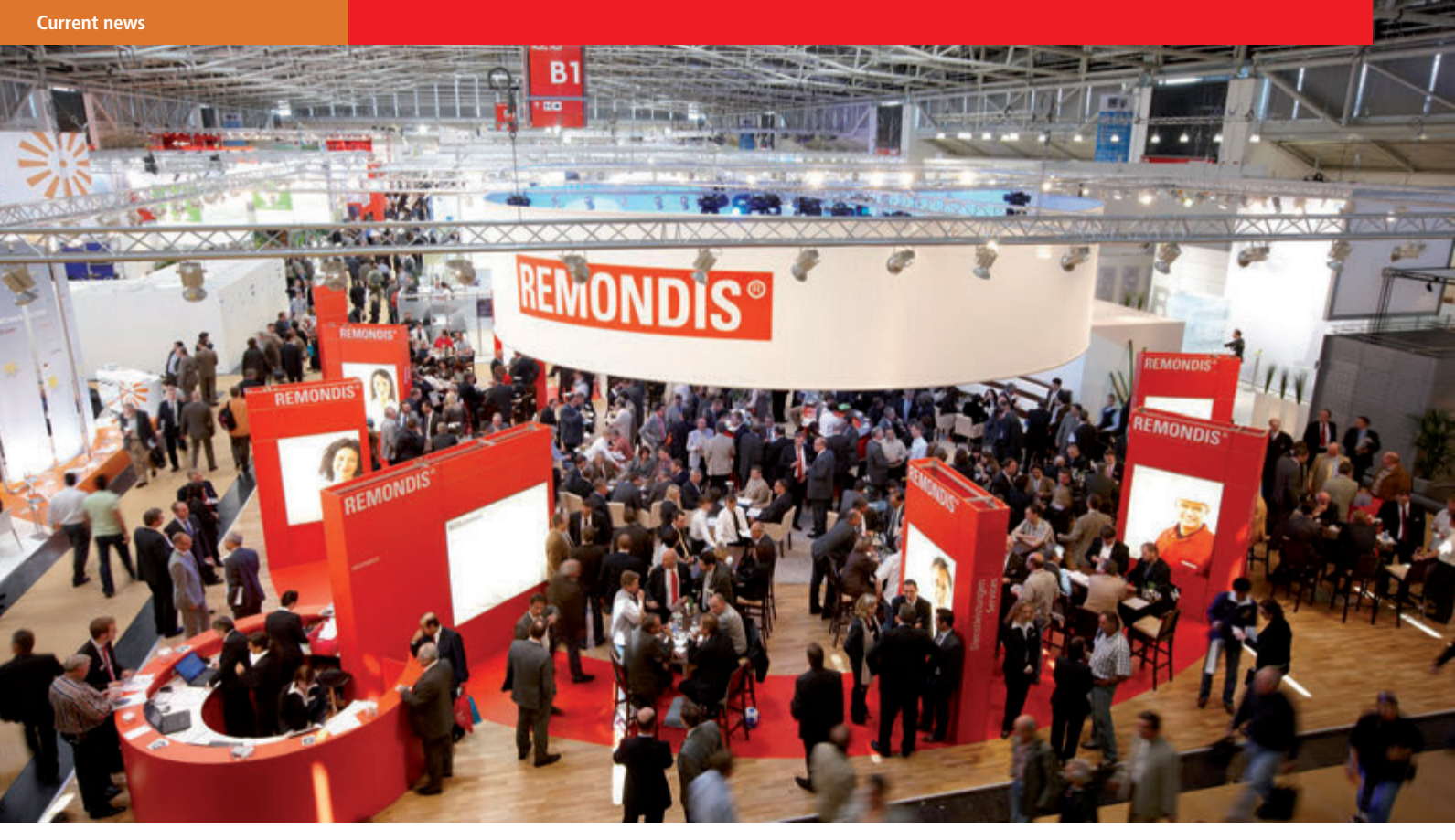
A full success: On every day of the exhibition, countless visitors gather information at the REMONDIS stand.